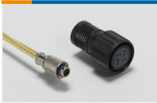
Standard Circular Connectors(124)